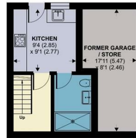
ANNEXE GROUND FLOOR