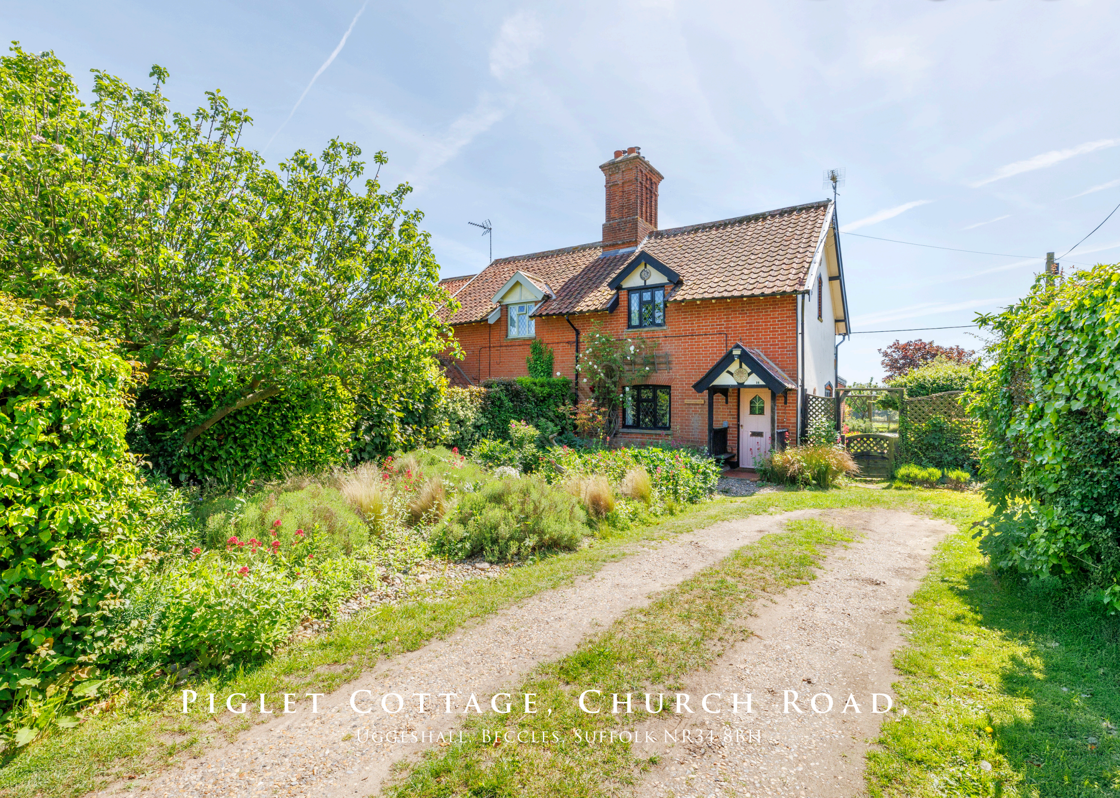
PIGLET COTTAGE, CHURCH ROAD, UGGESHALL, BECCLES, SUFFOLK NR34 8BH