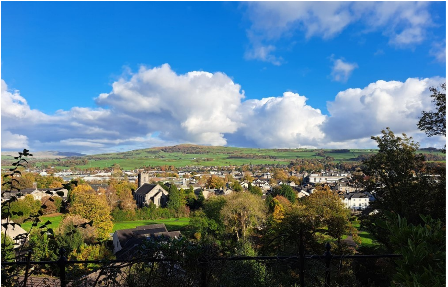
Vendors Own Photo