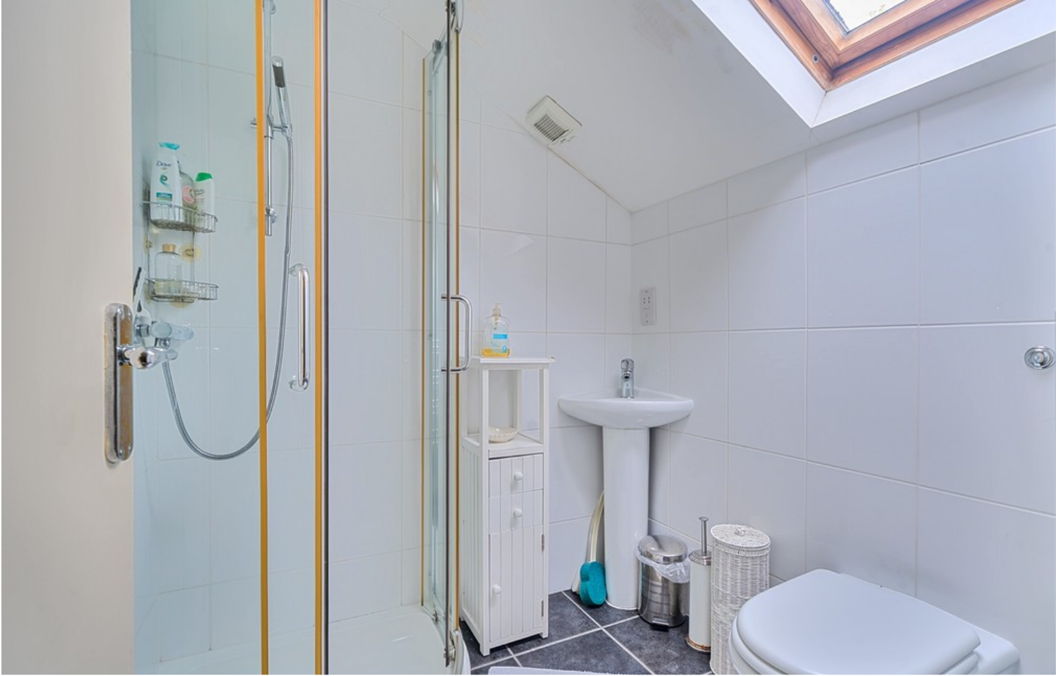
En-suite Shower Room to Bedroom Four