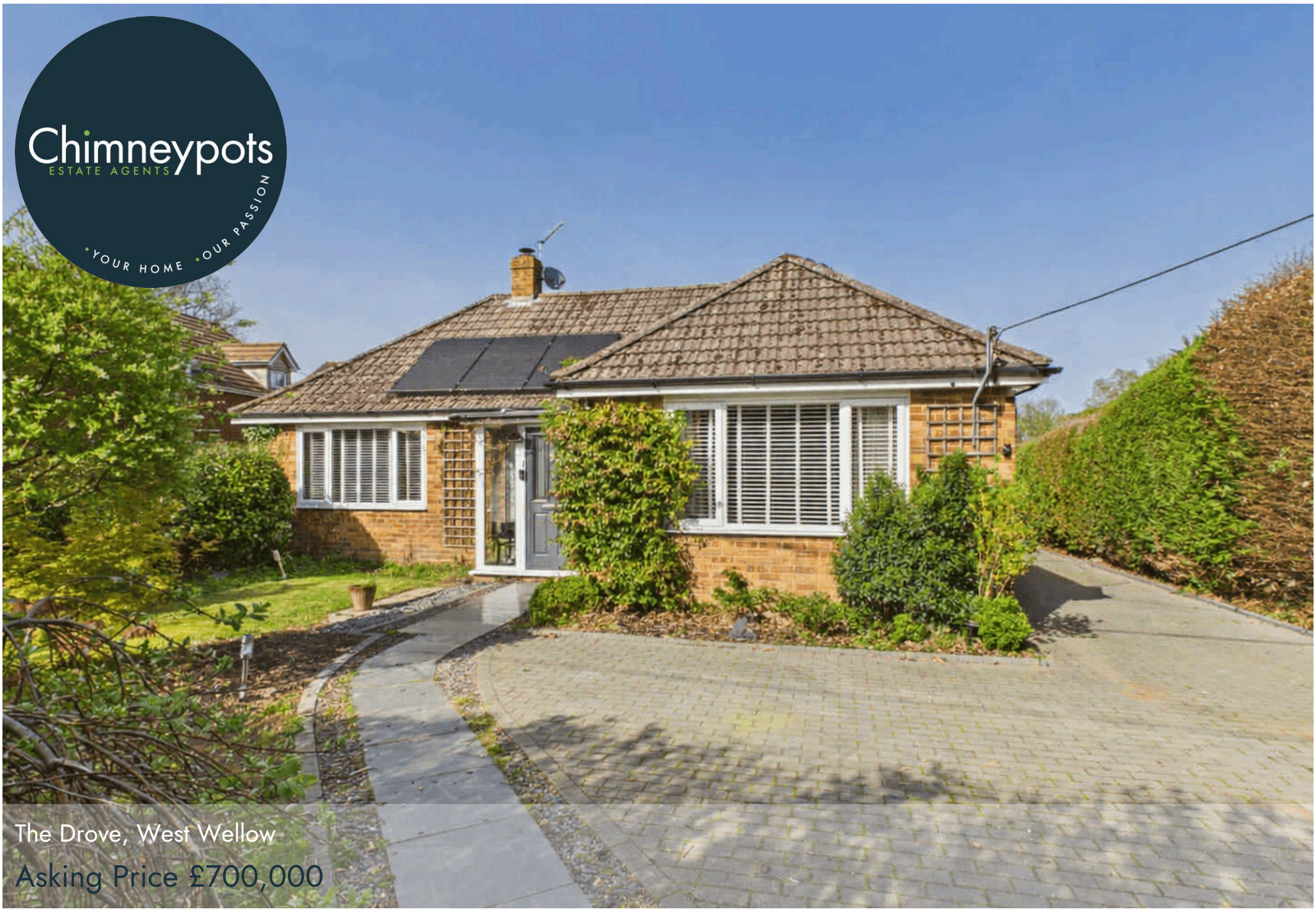
The Drove, West Wellow Asking Price £700,000