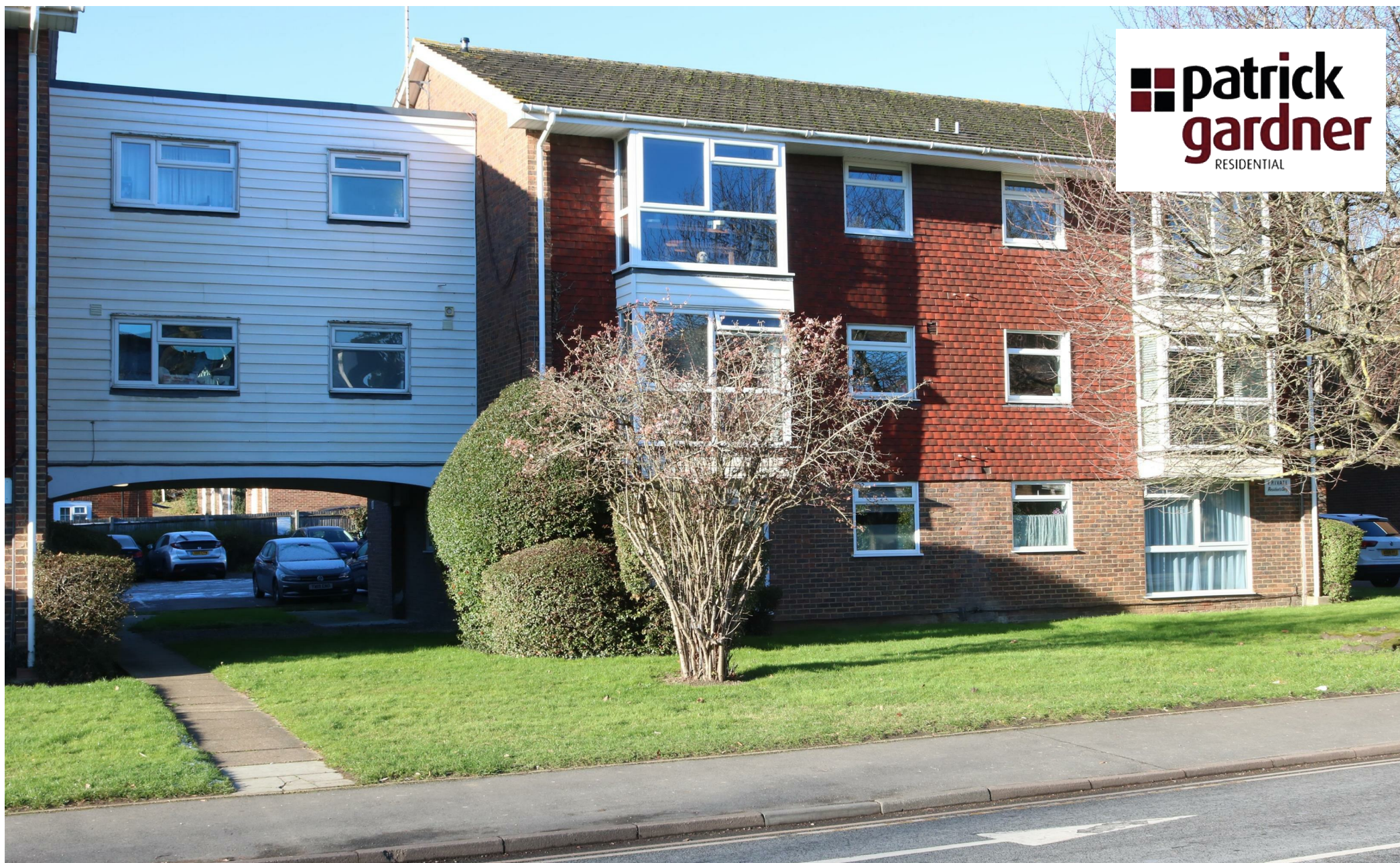
8 Copperfield Court, Leatherhead, KT22 7LD