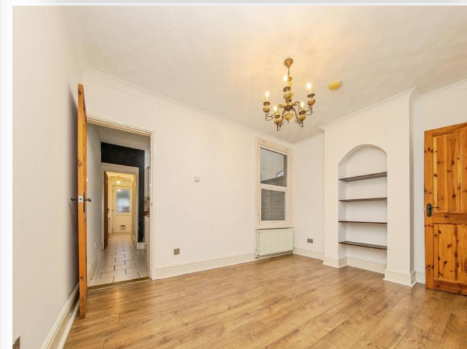
Gladstone Road, Ipswich, IP3 8AT