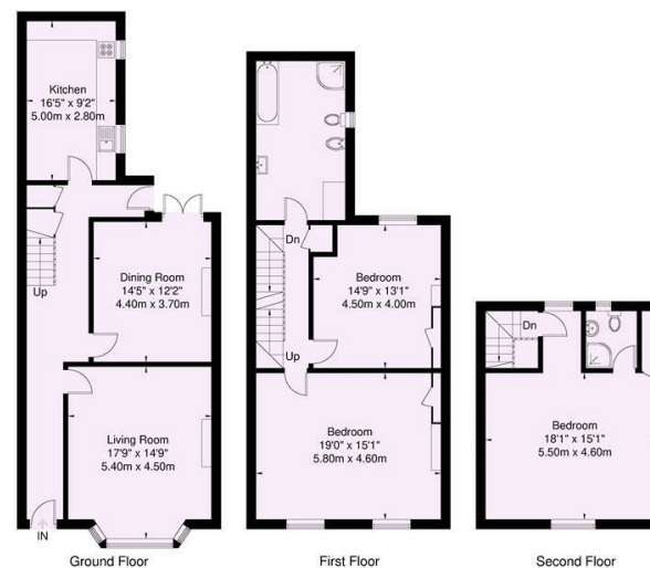
ILLUSTRATION FOR IDENTIFICATION PURPOSES ONLY ALL MEASUREMENT ARE MAXIMUM, AND INCLUDE WINDOW BAYS AND WARDROBES WHERE APPLICABLE THIS PLAN MUST NOT BE REPRODUCED BY ANY OTHER PERSON WITHOUT PERMISSION