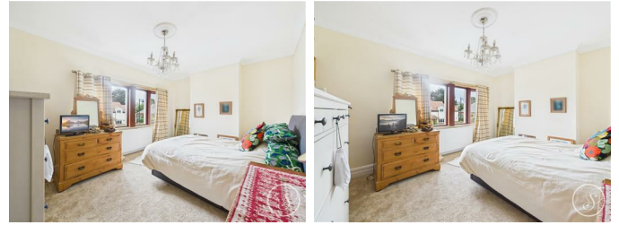
To the front aspect are two windows. Two built in wardrobes. Central heating radiator. Built in storage cupboard.