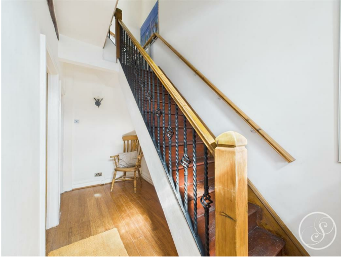
Staircase leading to first floor.