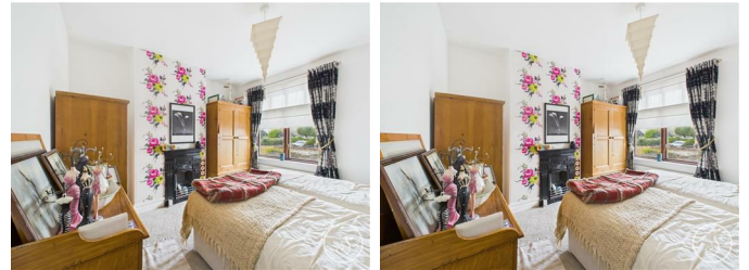
To the rear aspect is a window. Cast iron feature fire. Central heating radiator.