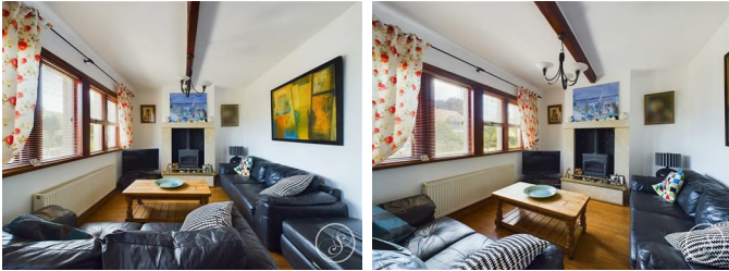
To the front aspect is a window. Feature gas fire. Central heating radiator.