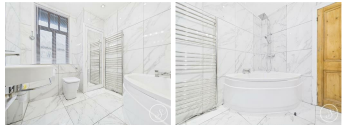
Bath with shower above, wash hand basin and wc. In addition there is tiling, heated towel rail, window and a built in cupboard housing the central heating boiler.