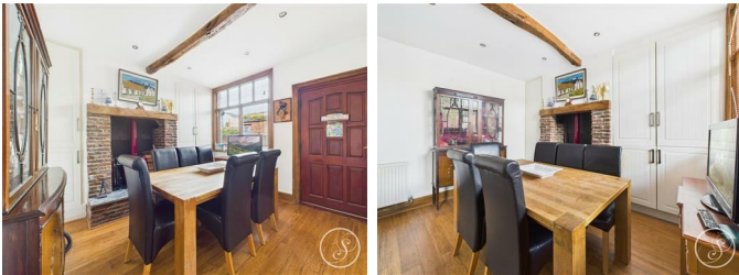
To the rear aspect is a window, and a door leading into the porch. Central heating radiator, wood burning stove and built in storage cupboards.