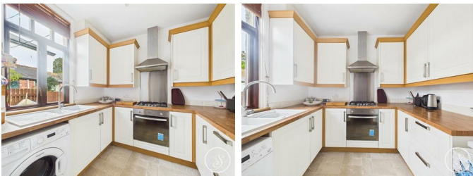
Fitted with a range of wall and base units with work surfaces over incorporating a sink and drainer unit. Electric oven and gas hob with cooker hood over. Space for a fridge/freezer. Window to rear aspect.