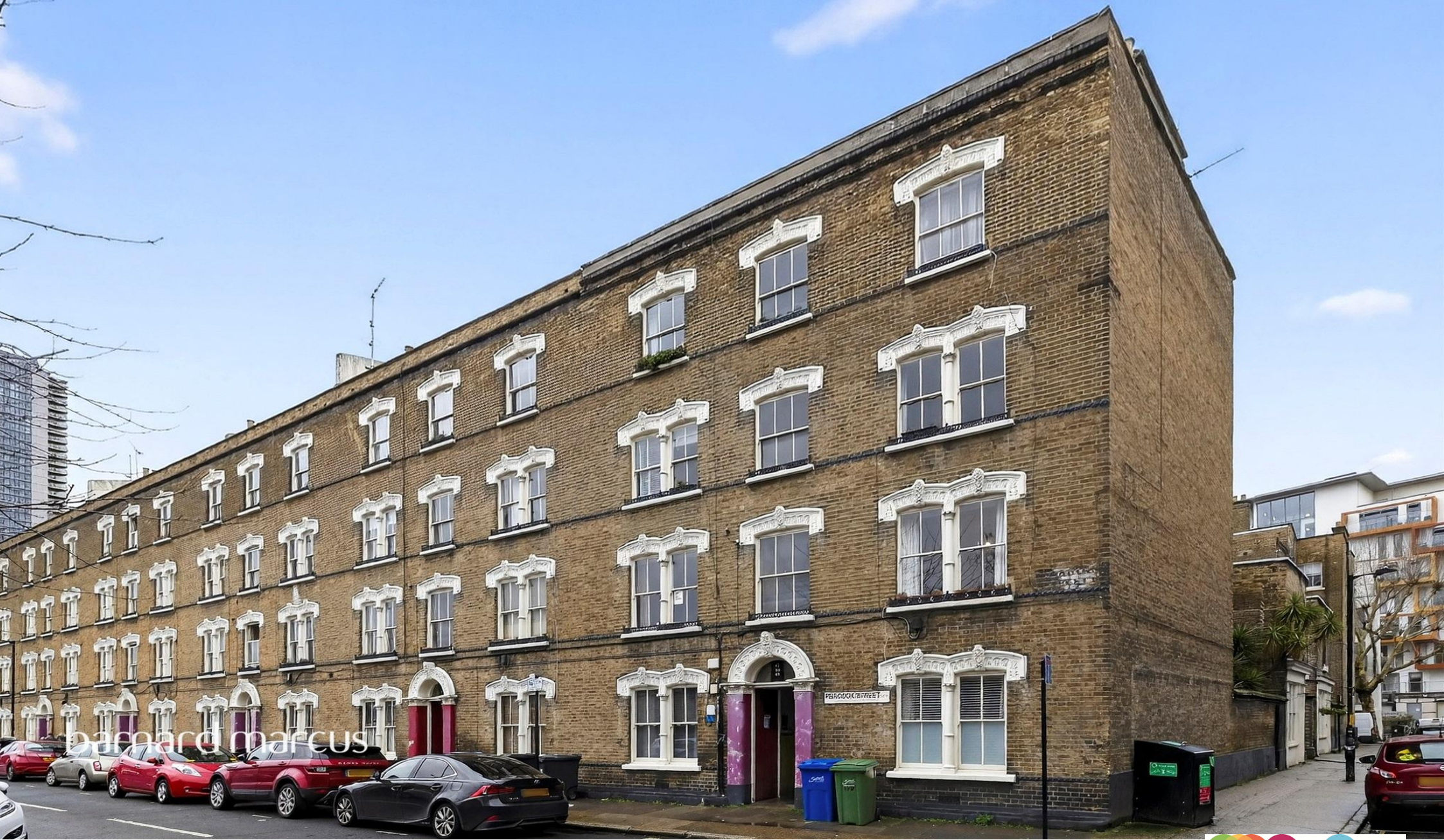
Pullens Buildings Peacock Street, London SE17