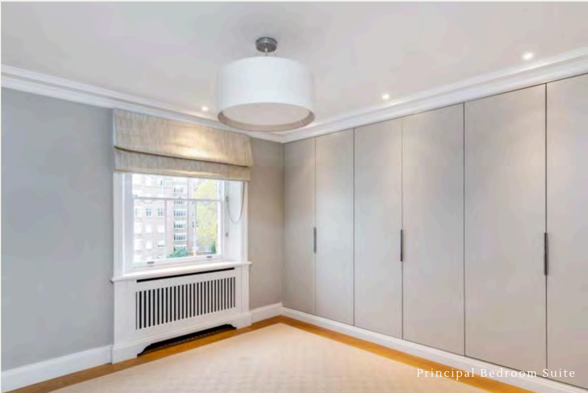
Principal Bedroom Suite