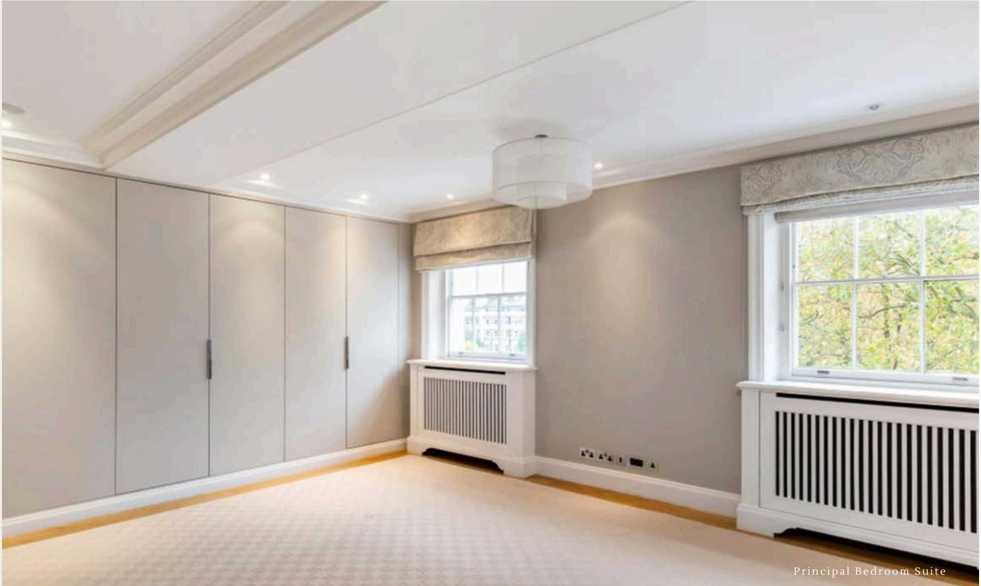
Principal Bedroom Suite

The principal bedroom suite shares the same garden-facing, south-facing aspect as the reception room, creating a peaceful and light-filled retreat. It boasts a spacious walk-in wardrobe and a luxurious double shower/steam room en suite, providing a spa-like experience at home. Two further well-proportioned double bedrooms offer flexibility for guests or family, served by a sleek and contemporary family bathroom. A guest WC adds convenience for visitors.