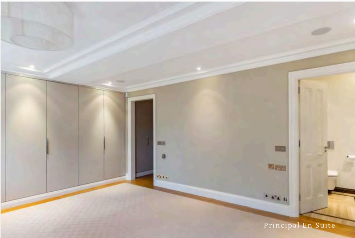
Principal En Suite