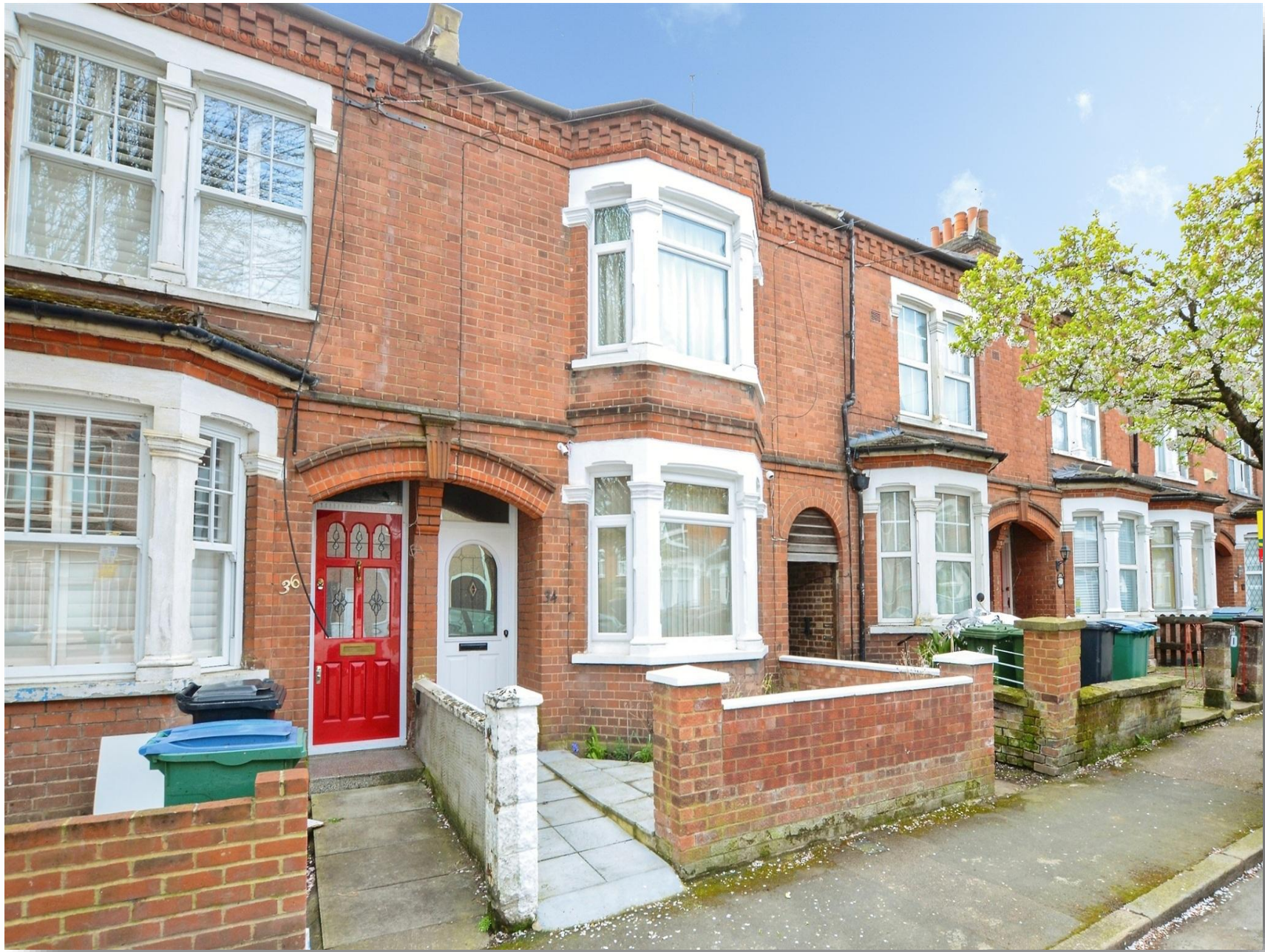
Bruce Grove, Watford, WD24 4DR