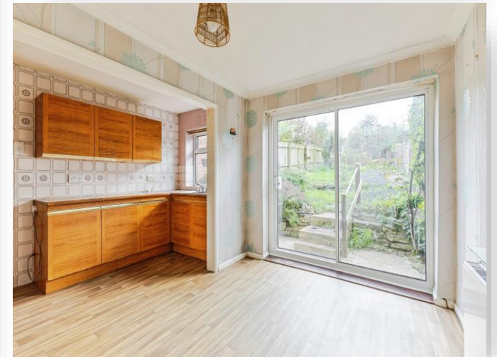
Chaucer Street, Northampton NN2 7HN