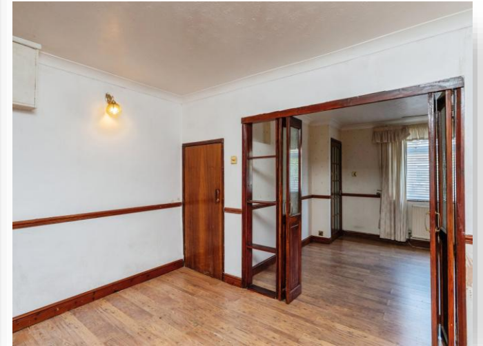
Meadows Place, Chester CH4 7ED