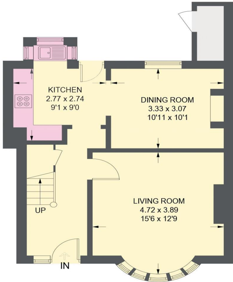
GROUND FLOOR = 45.2 SQ M / 486 SQ FT