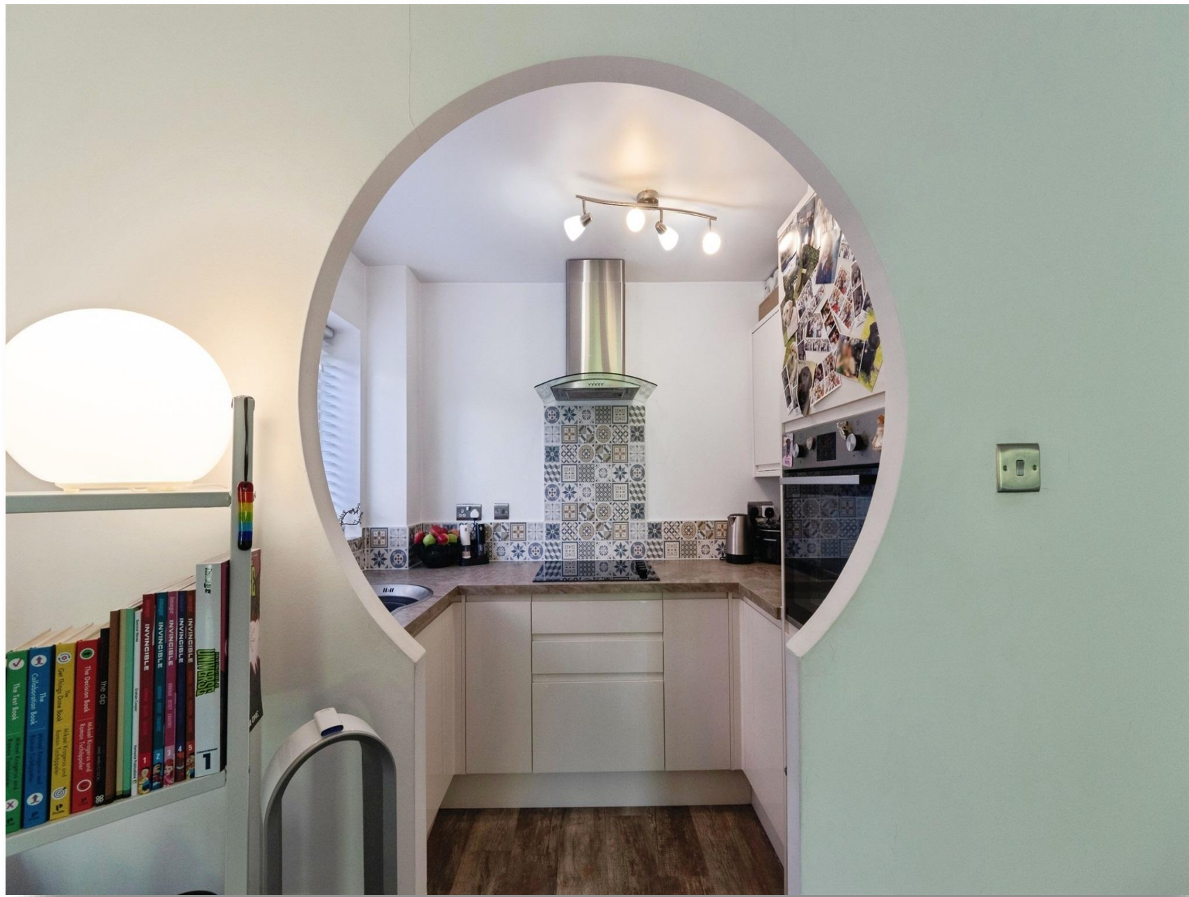
Maywell Drive, Solihull B92 0PR