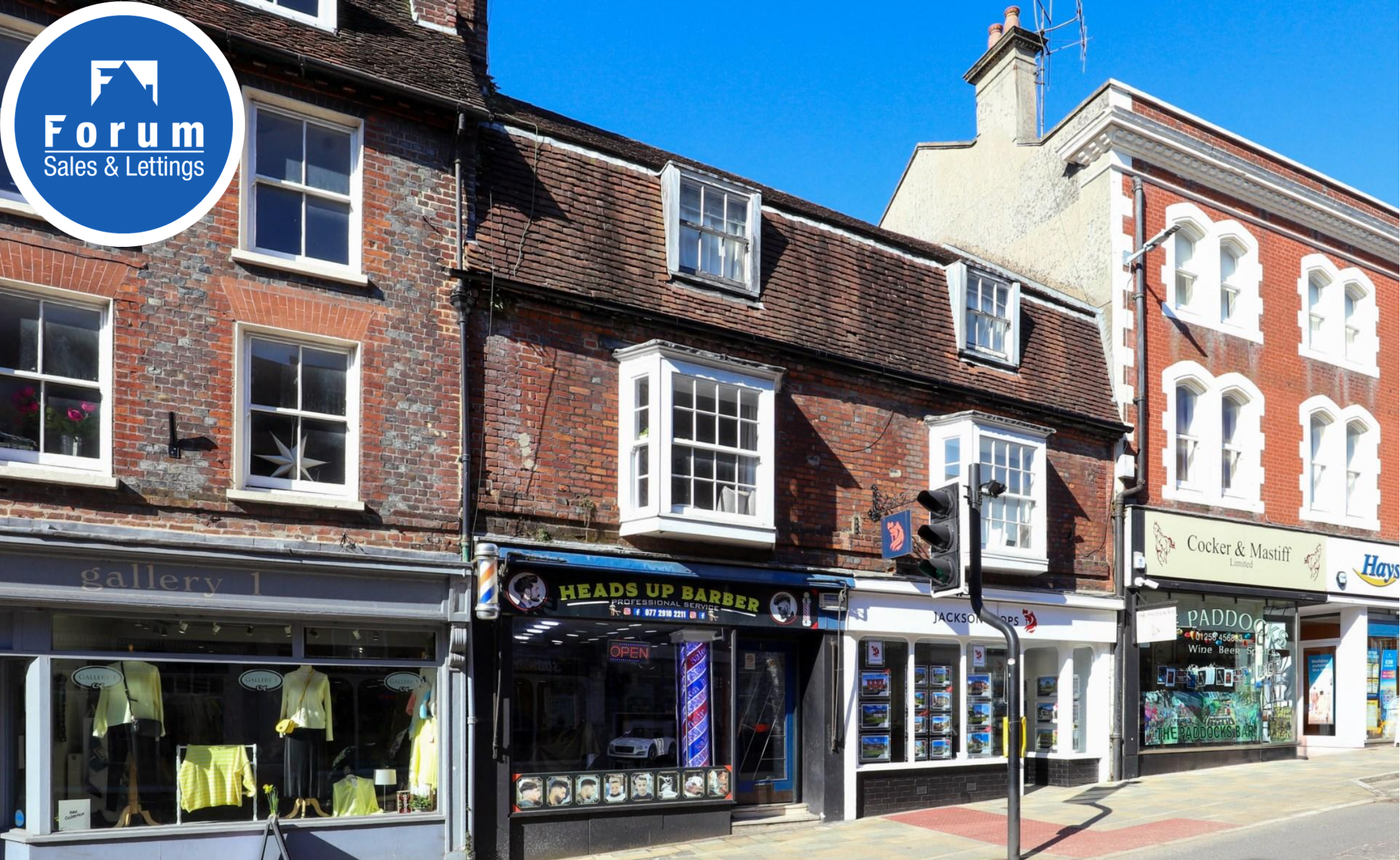
Flat 2,19, Salisbury Street, Blandford Forum, Dorset, DT11 7AU