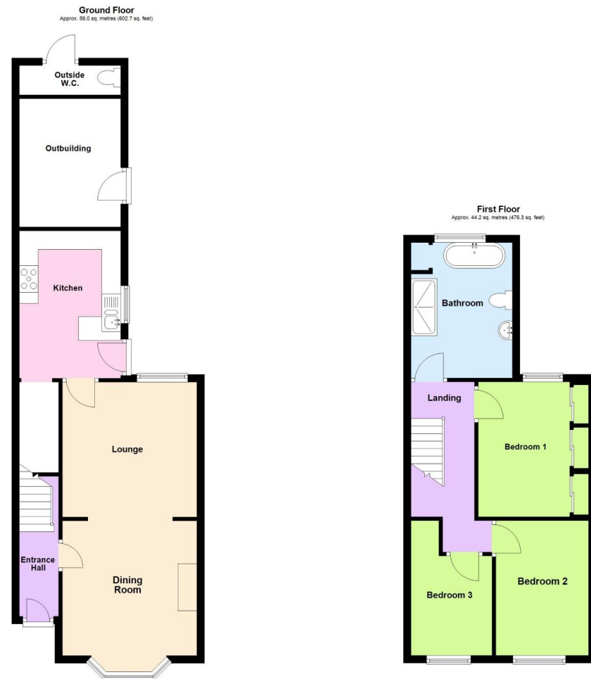
Total area: approx. 100.2 sq. metres (1078.9 sq. feet)