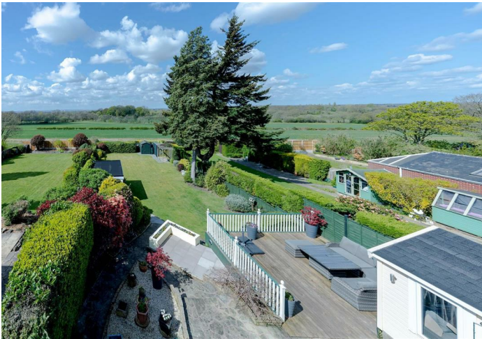
Rear Garden and View