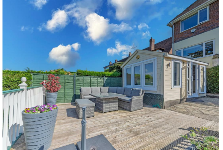
Rear Patio and Deck