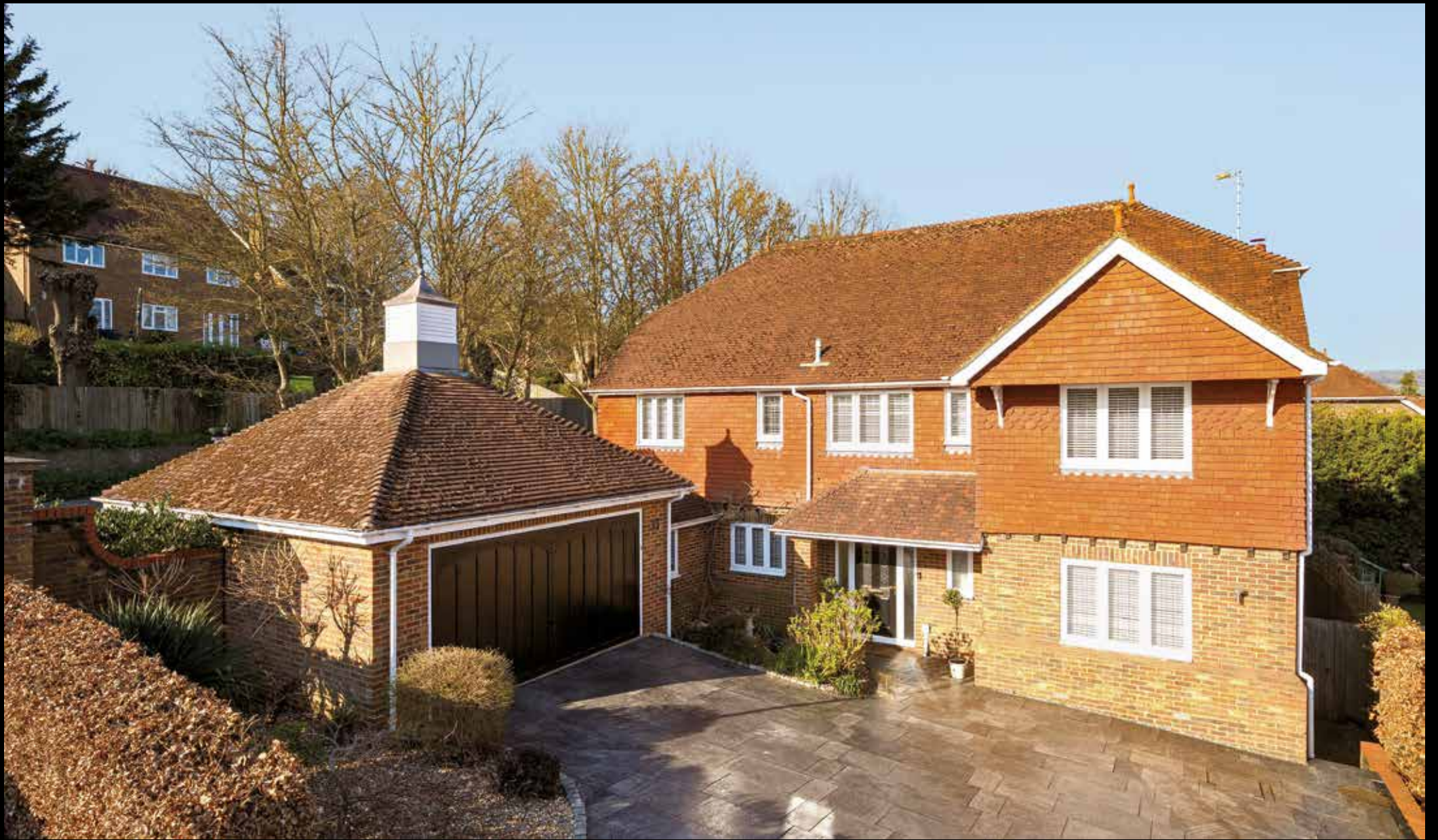
2 The Orchard Bearsted | Kent | ME14 4QL