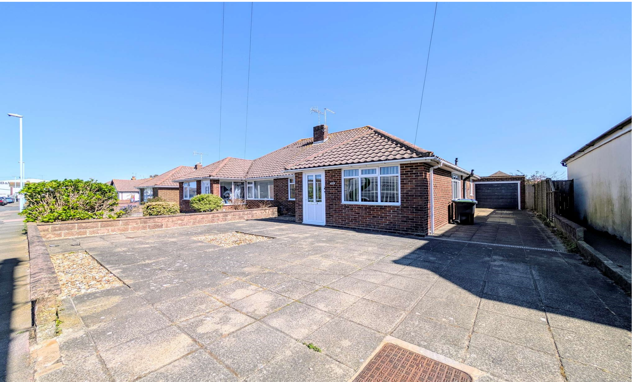
Meadow Road, Worthing BN11 2SB