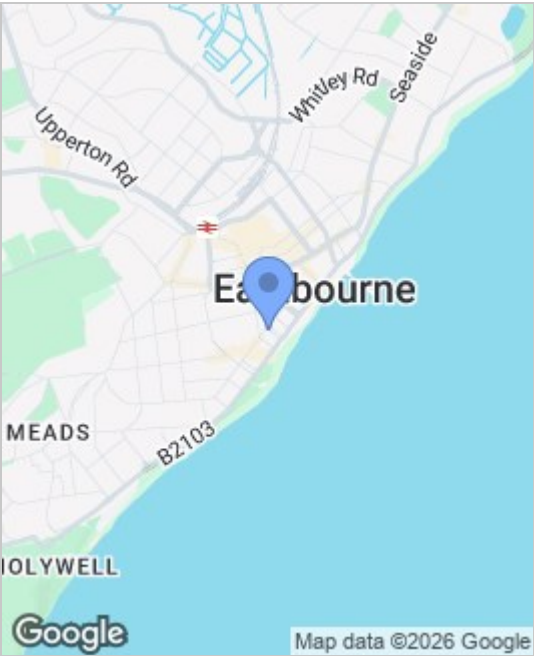
9 Lathom House

Share of freehold with approximately 992 year lease. Maintenance, approximately £1500 PA, TBC. Council Tax Band C Permission for pets may be sought from the Managing Agents.