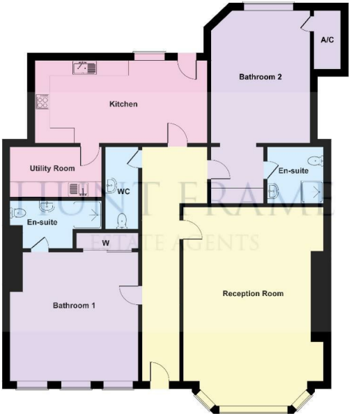
LOWER GROUND FLOOR Not to Scale. Produced by The Plan Portal on behalf of Hunt Frame. For Illustrative.