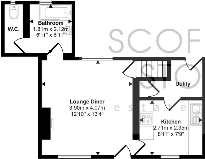
Ground Floor Approx 34 sq m / 364 sq ft

Approx Gross Internal Area 62 sq m / 668 sq ft