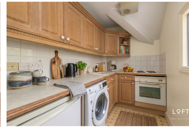
French Apartments, CR8

Approximate Gross Internal Area 55.8 sq m / 601 sq ft