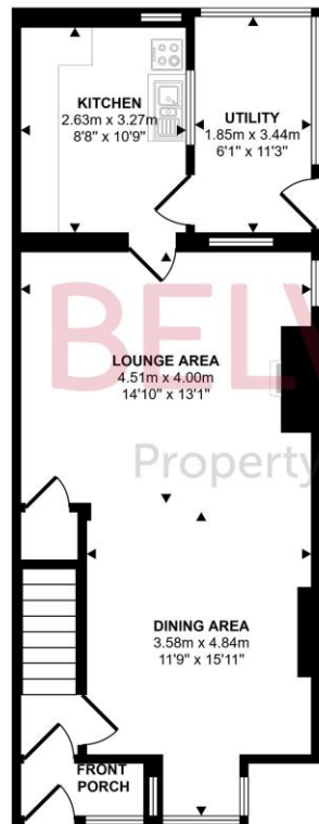
Ground Floor Approx 58 sq m / 625 sq ft

Approx Gross Internal Area 94 sq m / 1016 sq ft