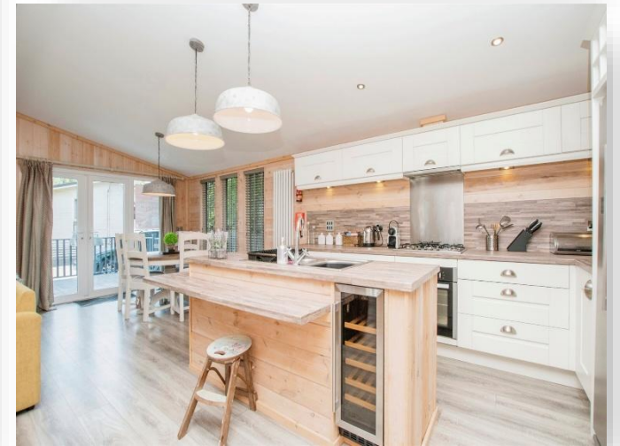
The Willows, Bacton Road, North Walsham NR28 0RA