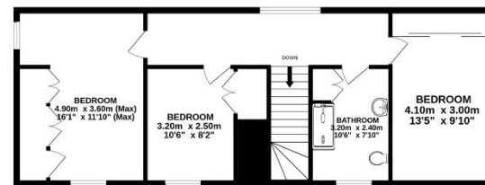
TOTAL FLOOR AREA : 147.5 sq.m. (1588 sq.ft.) approx.

Whilst every attempt has been made to ensure the accuracy of the floorplan contained here, measurements of doors, windows, rooms and any other items are approximate and no responsibility is taken for any error, omission or mis-statement. This plan is for illustrative purposes only and should be used as such by any prospective purchaser. The services, systems and appliances shown have not been tested and no guarantee as to their operability or efficiency can be given. Made with Metropix ©2026