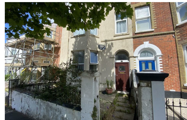
▼ Ground Floor