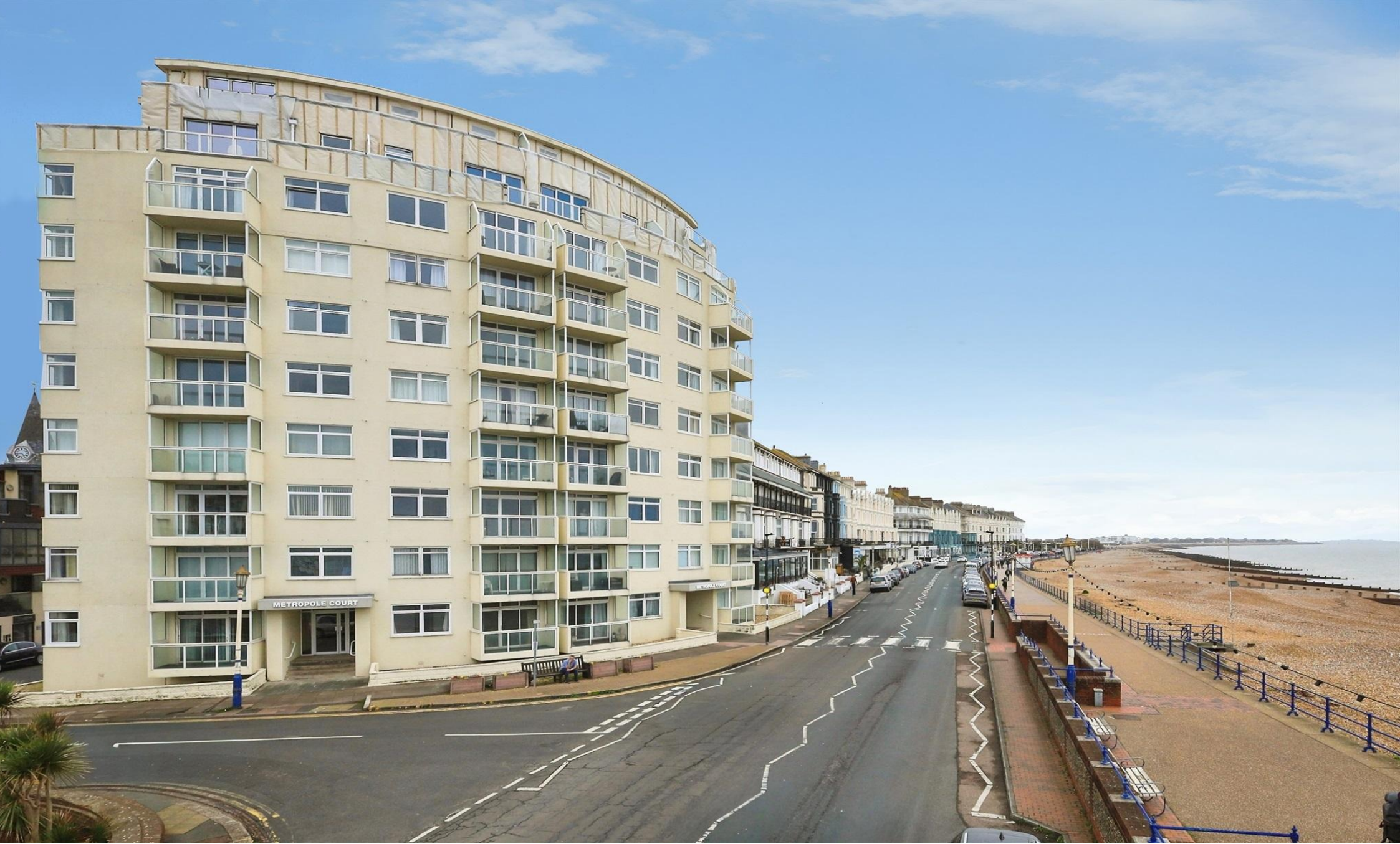
Metropole Court Royal Parade, Eastbourne BN22 7AX