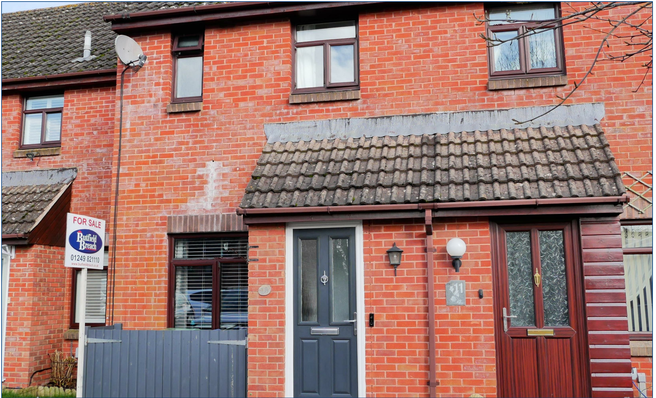
Tynning Park, Calne £235,000