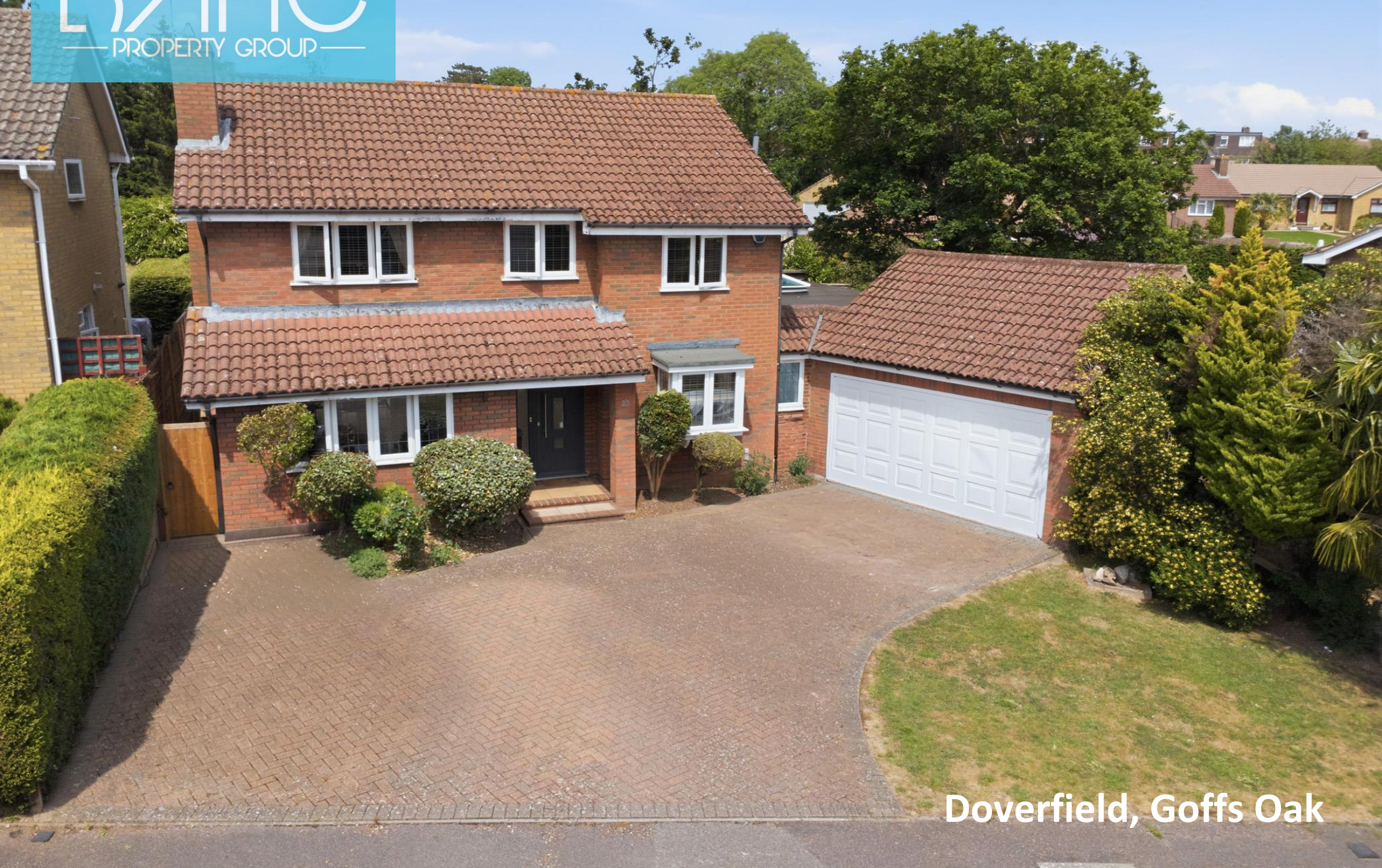
Doverfield, Goffs Oak