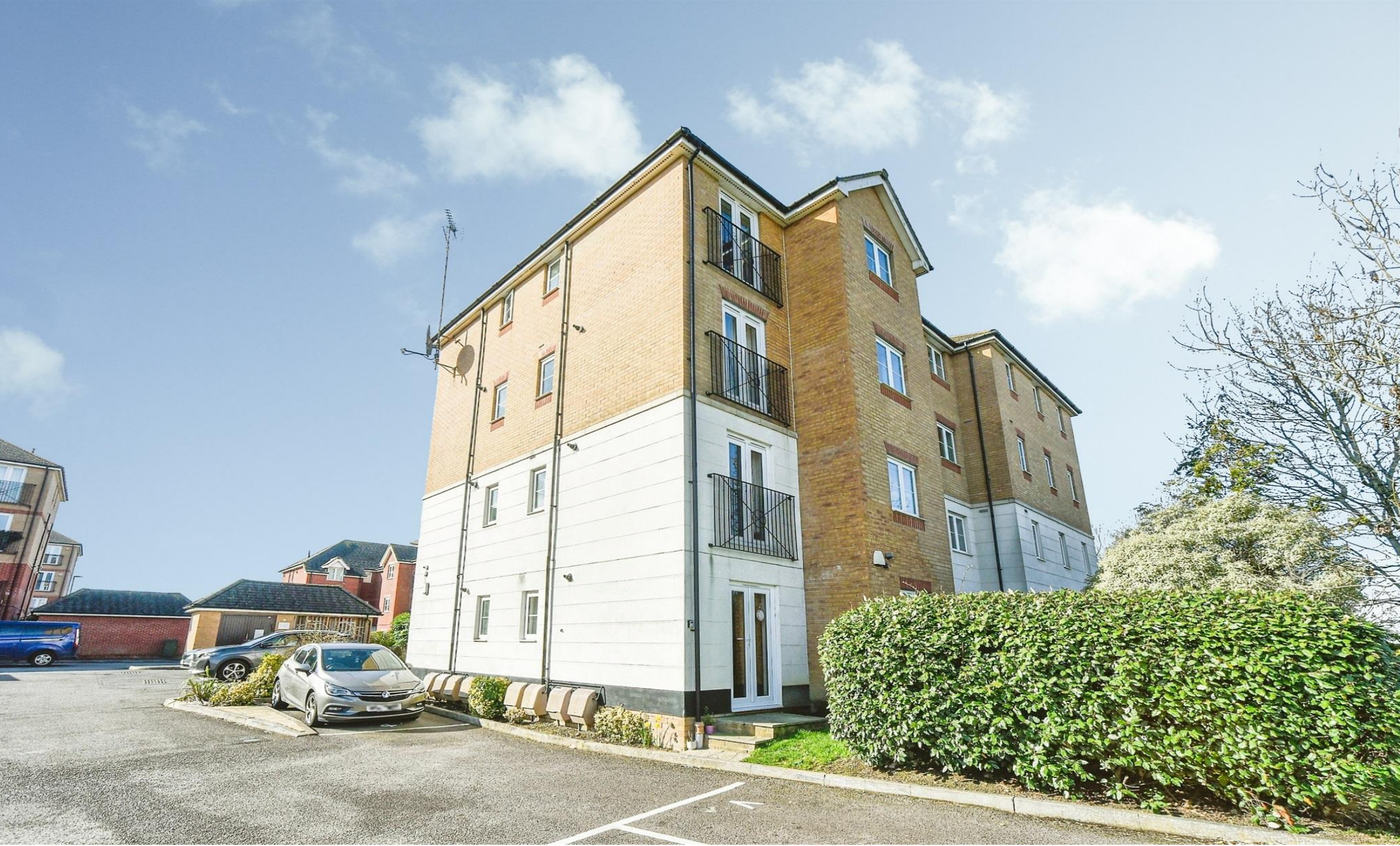
Franklin House Twickenham Close, Swindon SN3 3FB