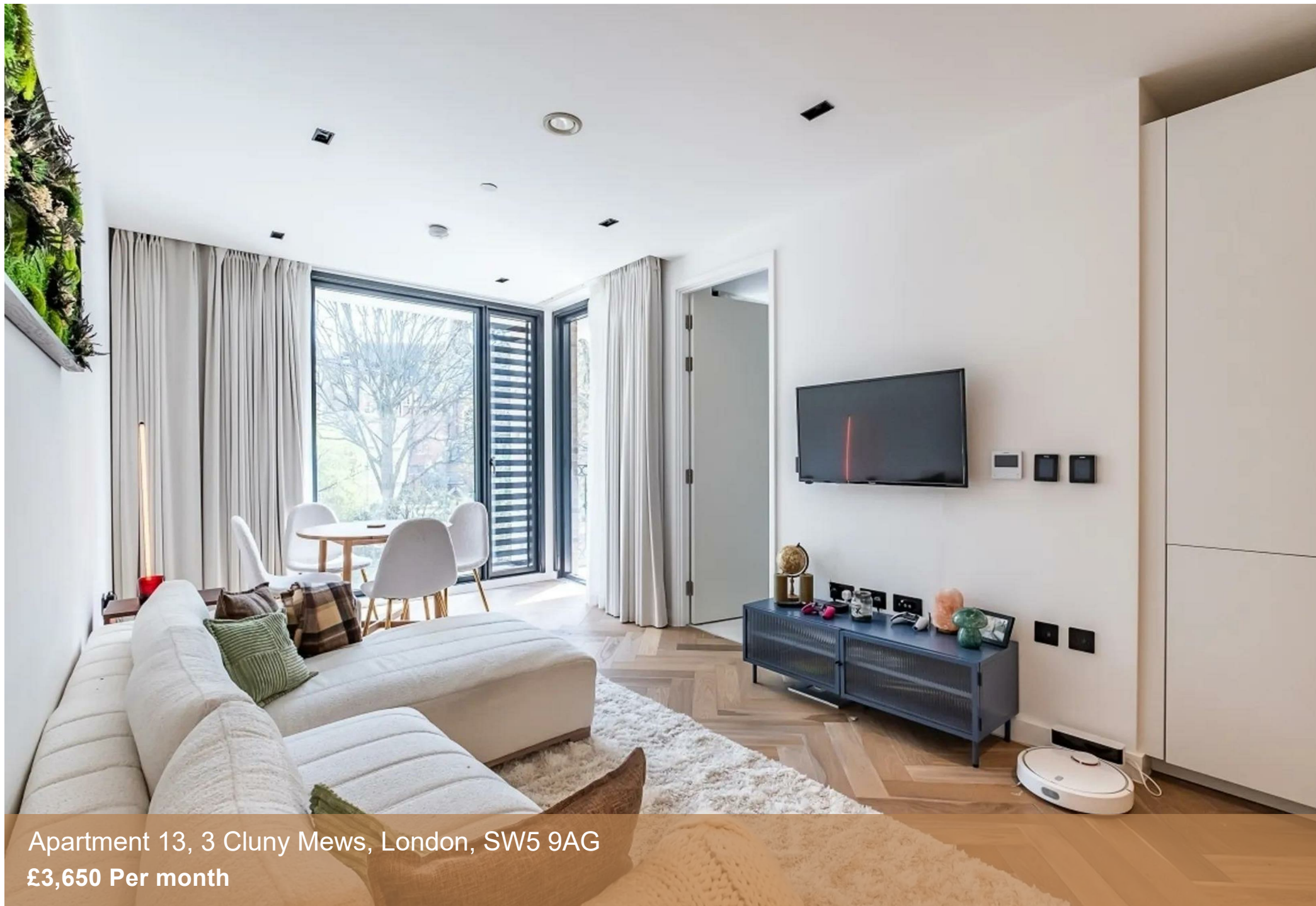
Apartment 13, 3 Cluny Mews, London, SW5 9AG £3,650 Per month