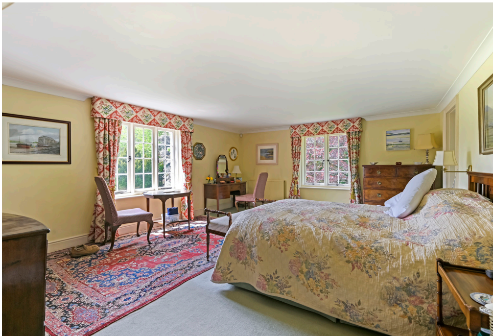
LAMBERT & FOSTER | FOTHERSBY, RYE ROAD