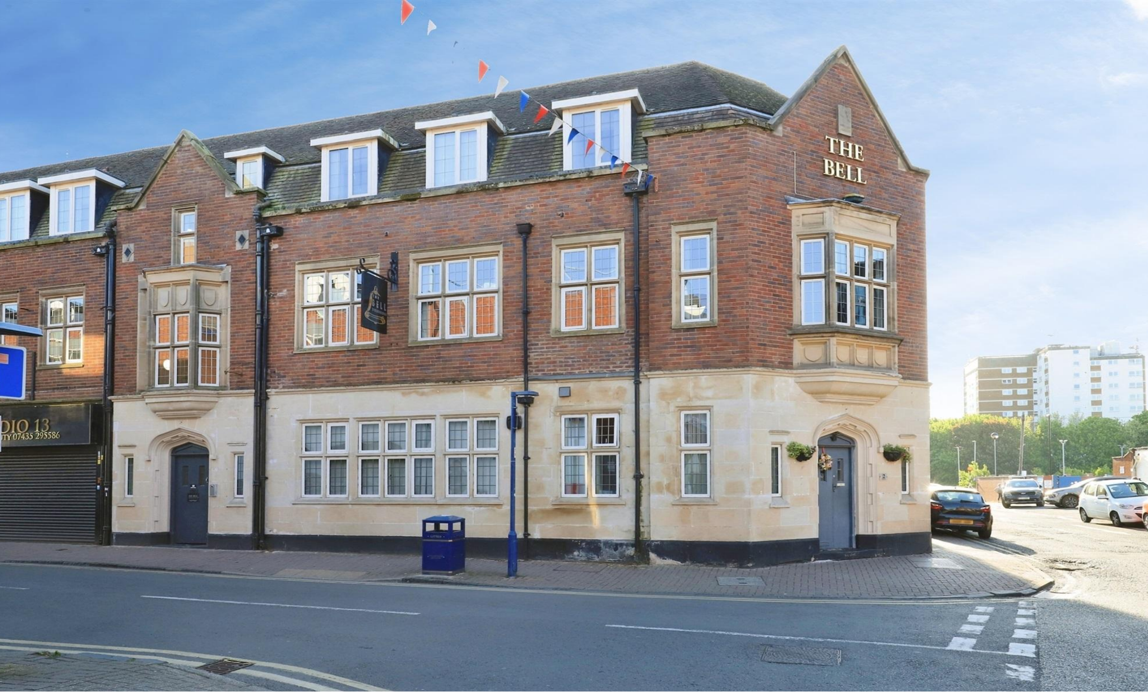
The Bell, Market Street, Stourbridge, DY8 1AG