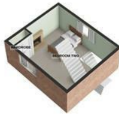
MEZZANINE 109 sq.ft. (10.1 sq.m.) approx.