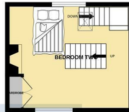
2ND FLOOR 229 sq.ft. (21.4 sq.m.) approx.