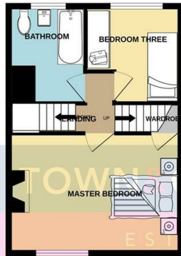
1ST FLOOR 364 sq.ft. (33.8 sq.m.) approx.