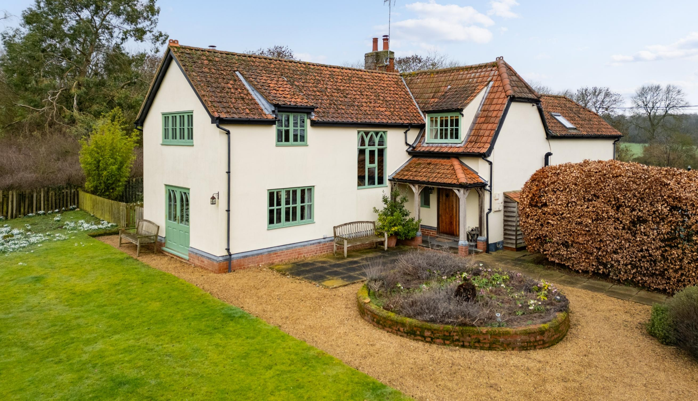
Potash Cottage, Pipers Lane CB11 4XJ