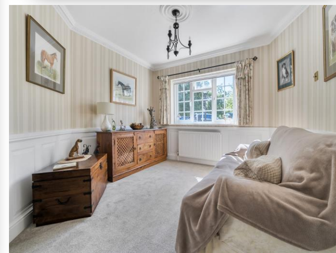
1 Strande View Walk, Cookham, Maidenhead SL6 9DL