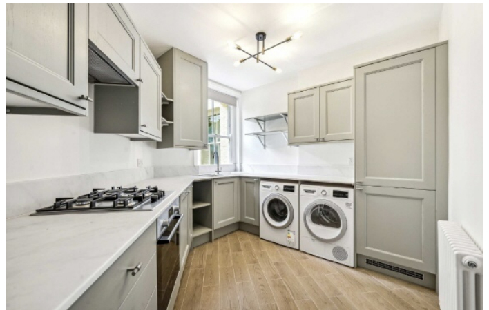
Queen's Club Gardens, W14