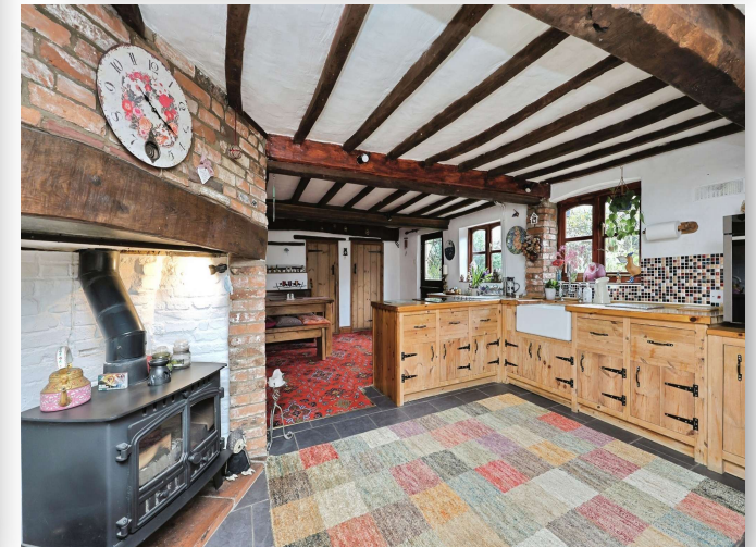
Old Bakery, Old Post Office Street, Shipdham, IP25 7PQ