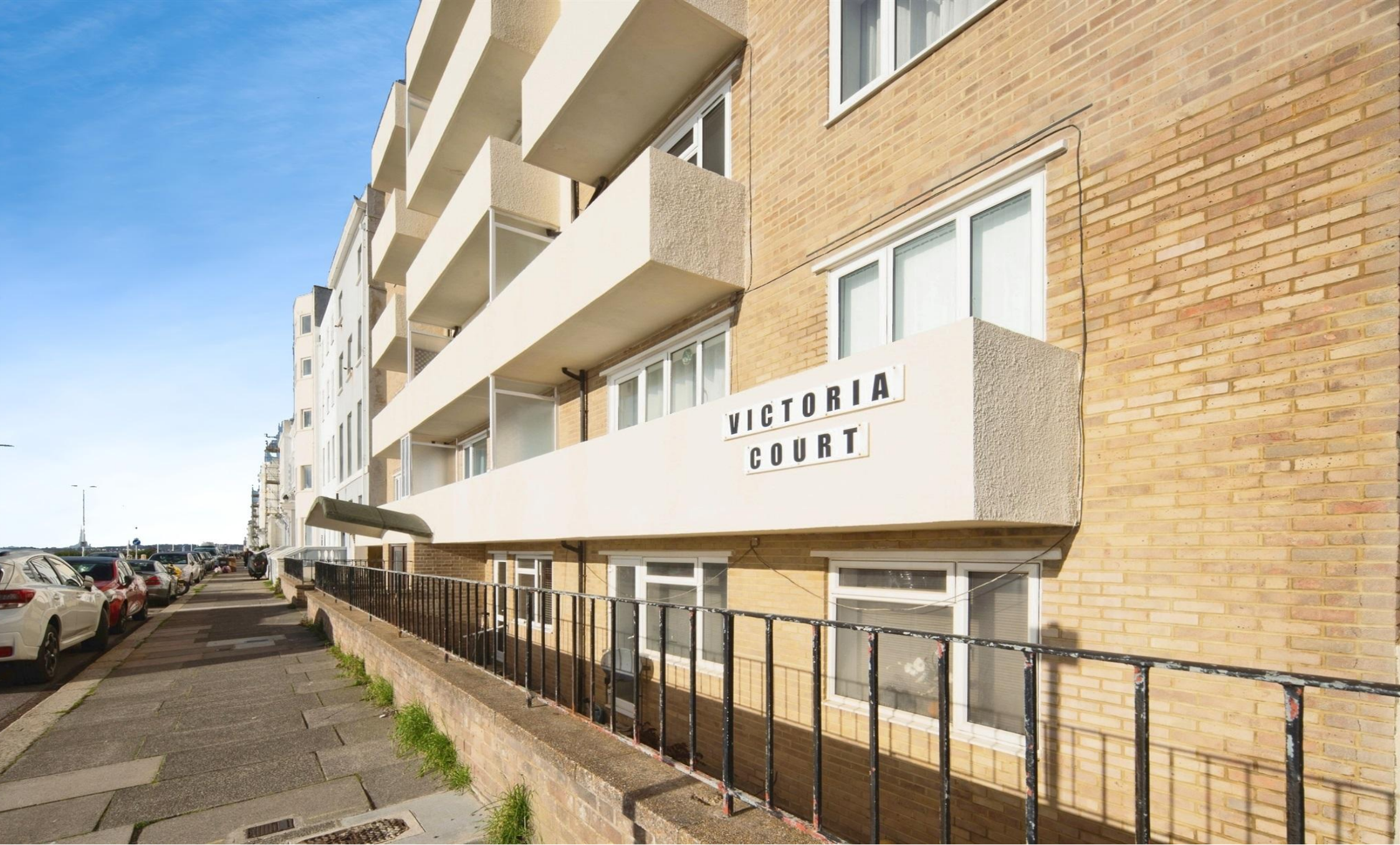
Victoria Court, St. Leonards-On-Sea TN38 0BH