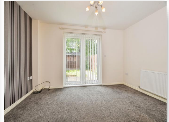
Bevan Close, Stockton-On-Tees TS19 8RF