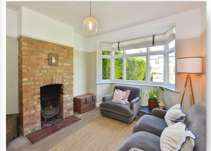
Calverton Road, Stony Stratford Milton Keynes MK11 1LE