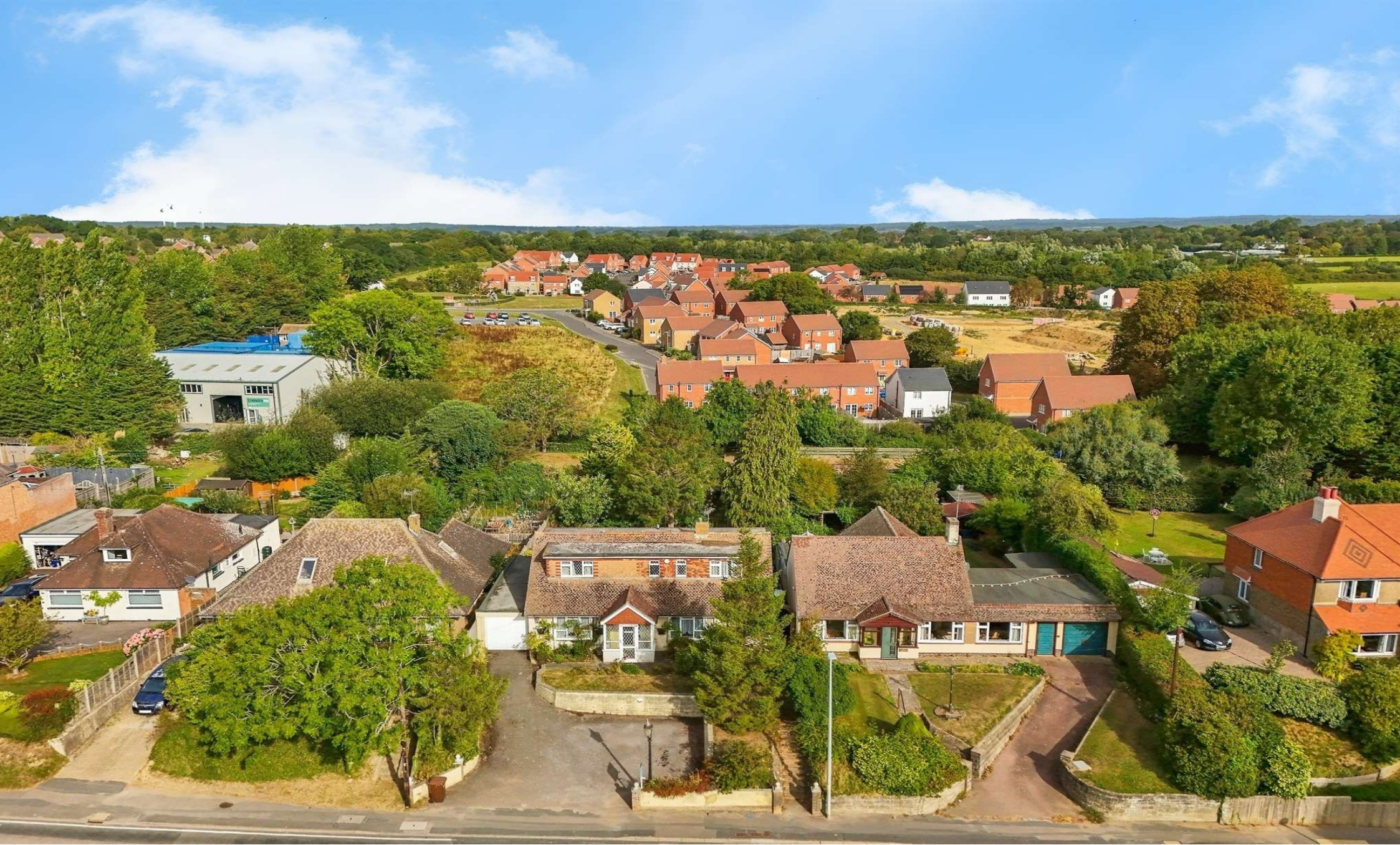
Hazelbank Rattle Road, Westham Pevensey BN24 5DS