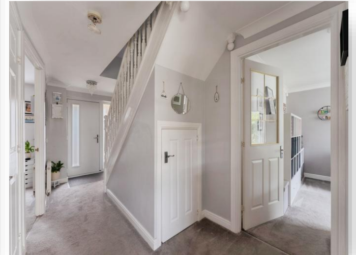
Hogarth Drive, Noctorum, Prenton, CH43 9HA