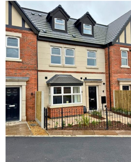
Roebuck Gardens, Nottingham NG8 2GT