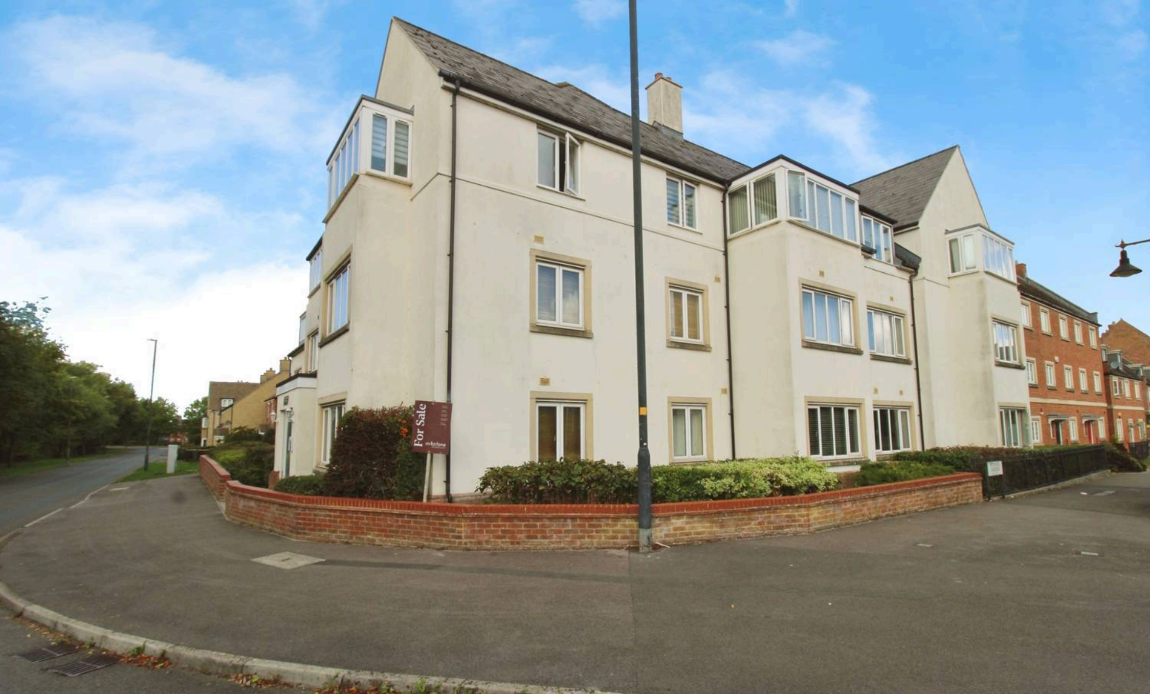
Flat 2, Walton House, 127 Redhouse Way Swindon