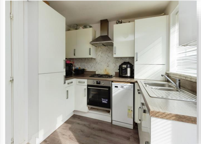
Siegen Way, Morley Leeds LS27 8FL