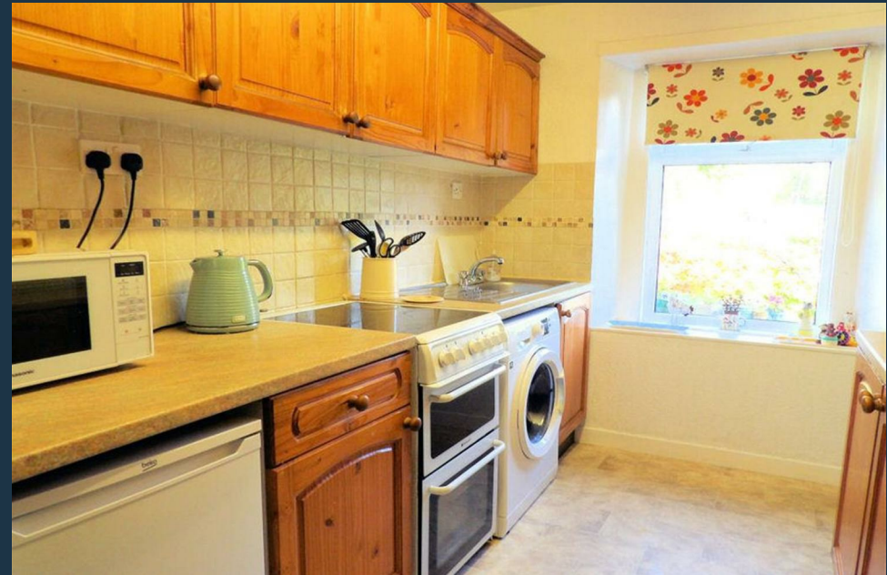
A charming Lounge with feature fireplace and access to a lovely bright kitchen