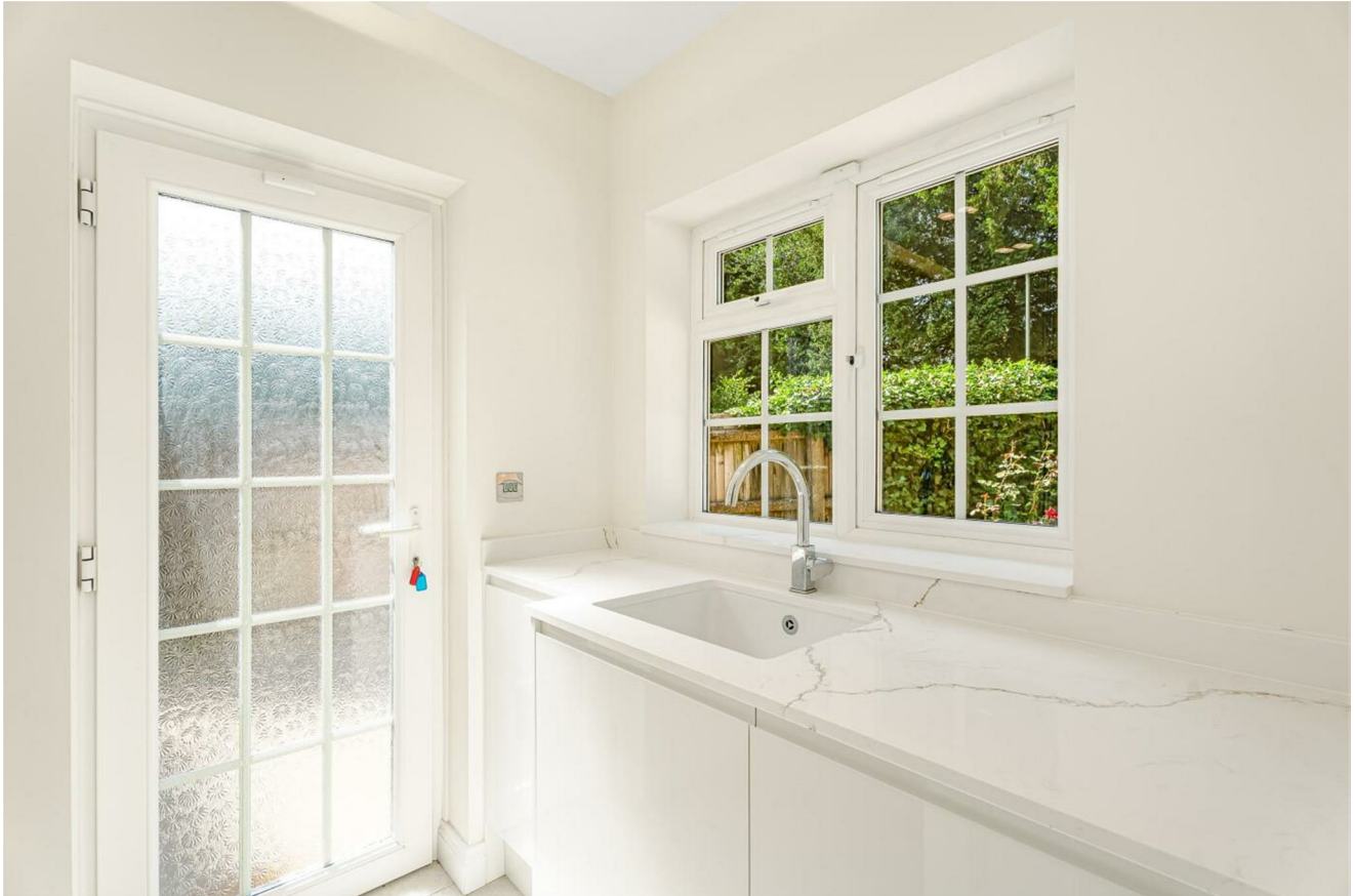
UTILITY ROOM (pic 2)

Double glazed window to rear and door garden. Fitted with gloss white, handleless wall & base units adorned with stone worktops & upstands, with stacked BOSCH washing machine and tumble dryer with floor to ceiling units around. Tiled floor.