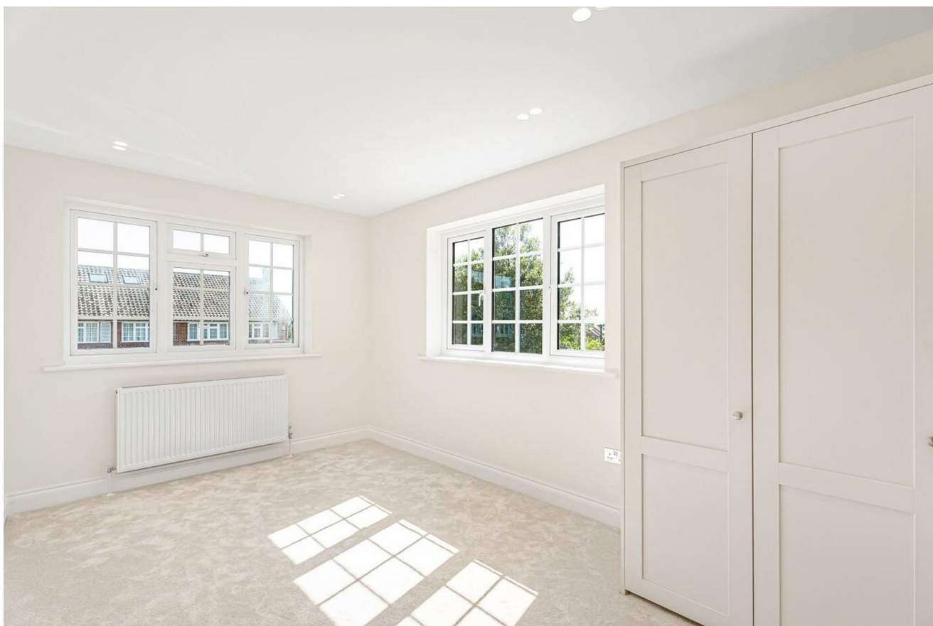
BEDROOM 1 (pic 2)

Dual Aspect with double glazed windows to front and side, carpeted floor, fitted wardrobes, door to ensuite.