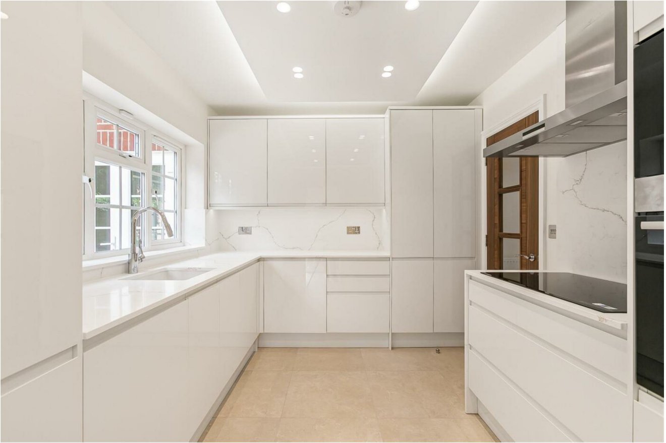
KITCHEN (pic 2)

With Double glazed window to the rear and doorway to the utility room. Fitted with gloss white, handleless wall & base units adorned with stone worktops & splashbacks, with integrated BOSCH appliances, including Fridge Freezer, Dishwasher, Oven & Microwave Oven, Induction hob and canopy extractor. Tiled floor and feature recessed lighting to ceiling.