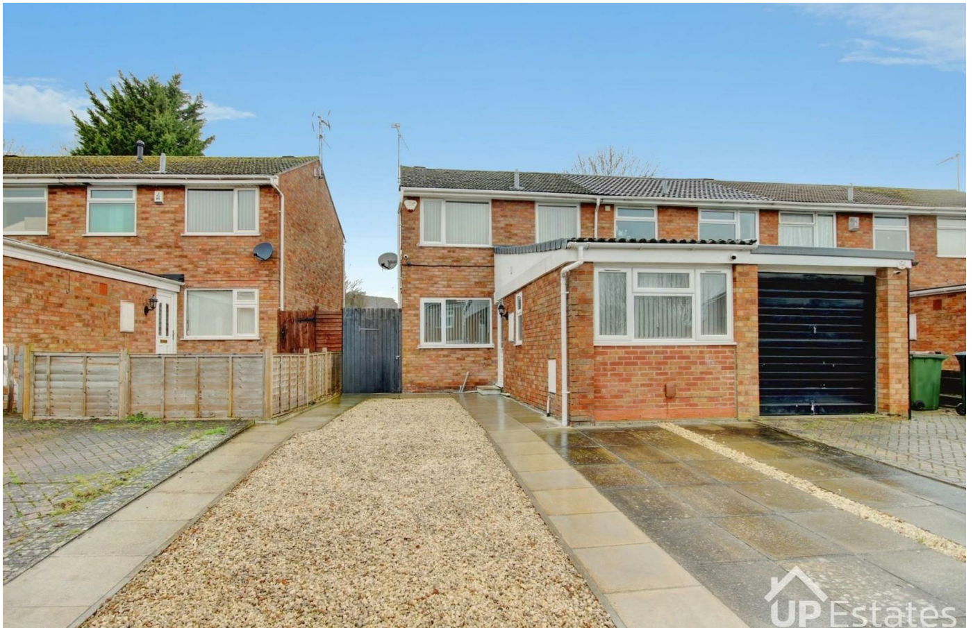
Dorchester Way, Coventry